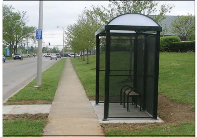
Above: Among the latest group of shelters to be erected is this one located on Eagle Creek Drive near the public library branch and Saint Joseph East Hospital. Below: Southland/B.C.T.C. Route.

Yet another new route in the final planning stage is a Nicholasville Road Commuter Express, Route 41-X from Man O' War Boulevard inbound to the transit center. This service will be designed to provide commuters from south Lexington and Nicholasville/Jessamine County an opportunity to park their vehicles and access LexTran during morning and afternoon rush hours, Monday through Friday. Express stops include Central Baptist Hospital and UK.